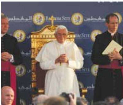
Pope Benedict XVI at the Baptism site