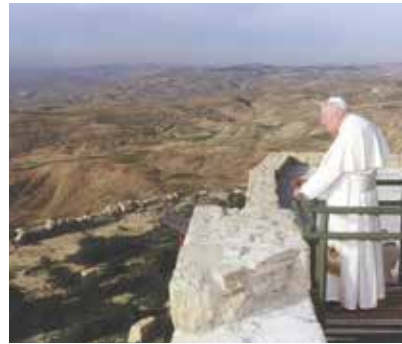
Pope John Paul II at Mount Nebo