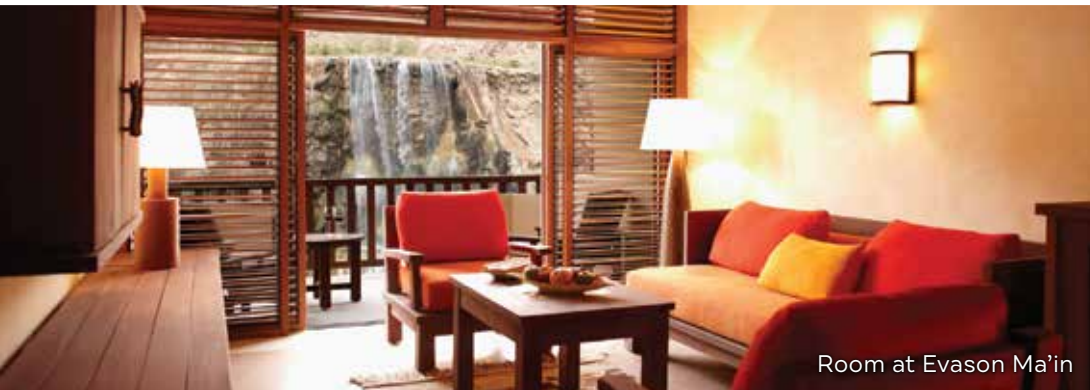
Room at Evason Ma'in