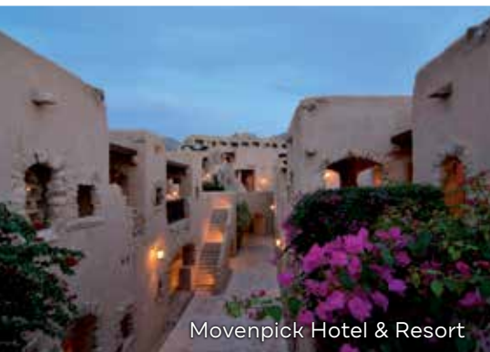
Movenpick Hotel & Resort

Dead Sea therapies are so highly regarded by some EU countries, including Germany and Austria, that long stays in the area are available courtesy of their health insurance plans.