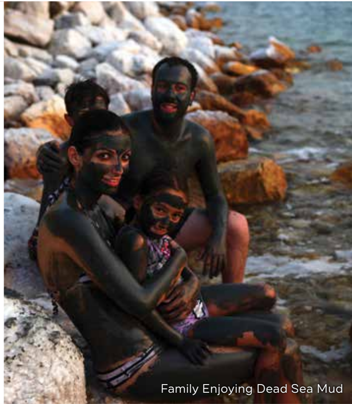
Family Enjoying Dead Sea Mud