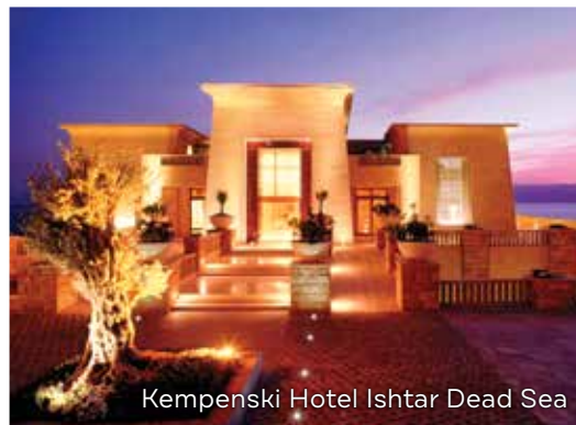
Kempinski Hotel Ishtar Dead Sea