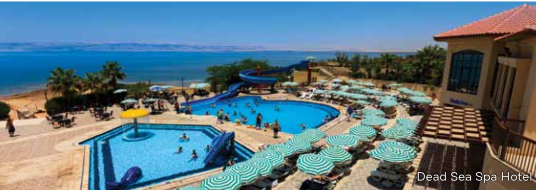
Dead Sea Spa Hotel