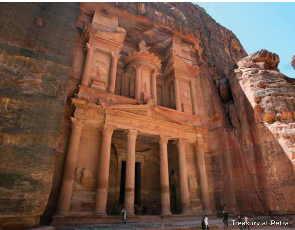
Treasury at Petra

The Treasury is the first of the many wonders that make up Petra. You will need at least 2 to 3 days to really explore everything here.