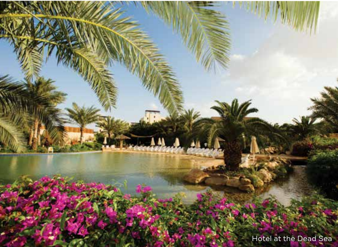
Hotel at the Dead Sea