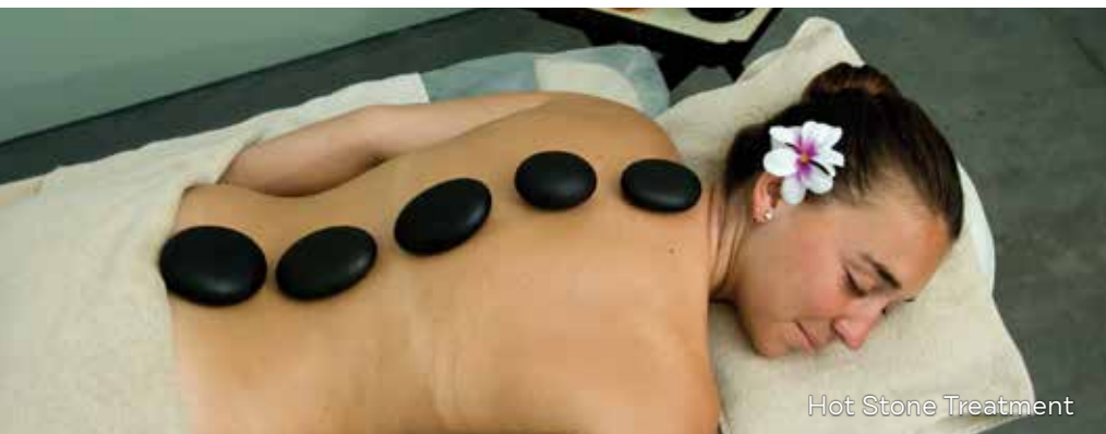
Hot Stone Treatment