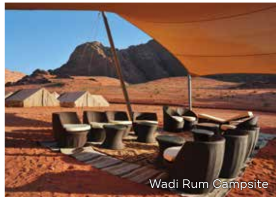
Wadi Rum Campsite