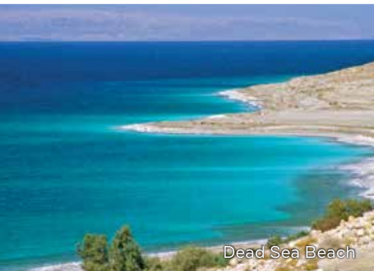
Dead Sea Beach