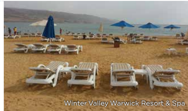
Winter Valley Warwick Resort & Spa