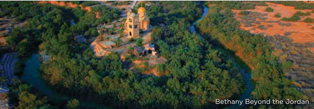
Bethany Beyond the Jordan