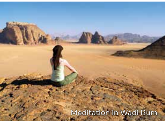
Meditation in Wadi Rum