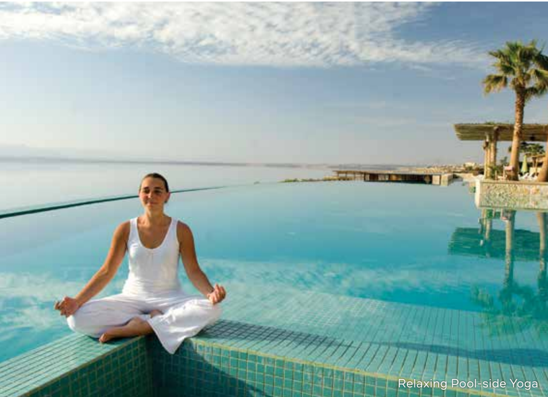
Relaxing Pool-side Yoga

One of the most spectacular natural and spiritual landscapes in the world, the Jordanian eastern coast of the Dead Sea has evolved into a major hub for both the religious and the health & wellness tourism in the region. A series of good roads and excellent hotels, with premier spa and fitness facilities, make this region both accessible and comfortable. Plus, vast archaeological and spiritual discoveries make this spot as enticing to today's international visitors as it was to kings, emperors, traders, prophets and pilgrims in antiquity.