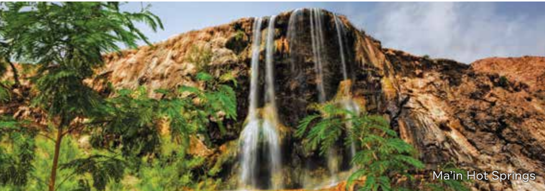
Ma'in Hot Springs