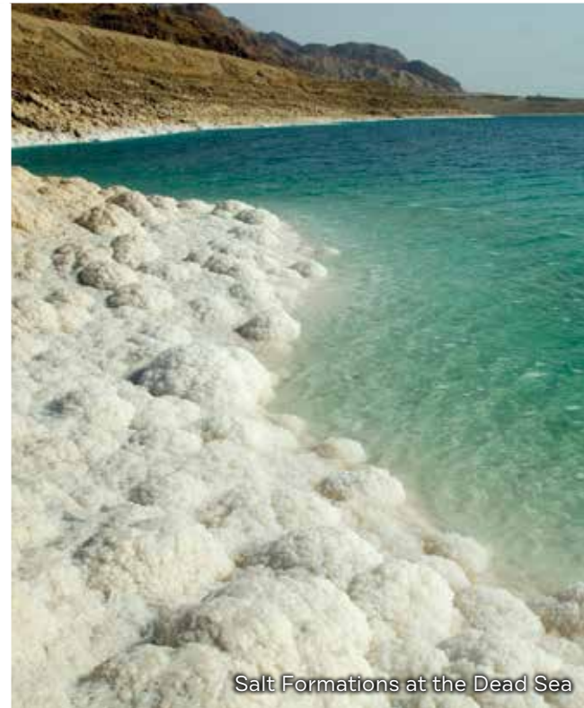
Salt Formations at the Dead Sea