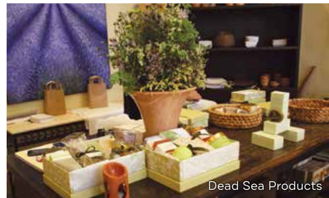
Dead Sea Products

No trip to the Dead Sea is complete without a visit to one of the many outlets that sell the world-famous Dead Sea products. These products are reasonably-priced, of excellent quality, and make great gifts. There are also many shops selling Jordanian handicrafts, rugs, Bedouin jewelry, mosaics, sand bottles, glassware and other locally-made items.