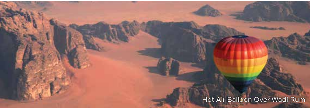
Hot Air Balloon Over Wadi Rum