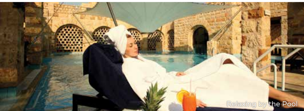
Relaxing by the Pool

Another way to relieve stress at the Dead Sea is by joining one of the newly founded yoga and meditation groups that use the area's natural beauty and serenity to reach unrivaled levels of relaxation. Meditation, a new dimension to the unique Jordanian tourism product catalogue, brings peace to the heart & mind and promotes youth, wellbeing and health.