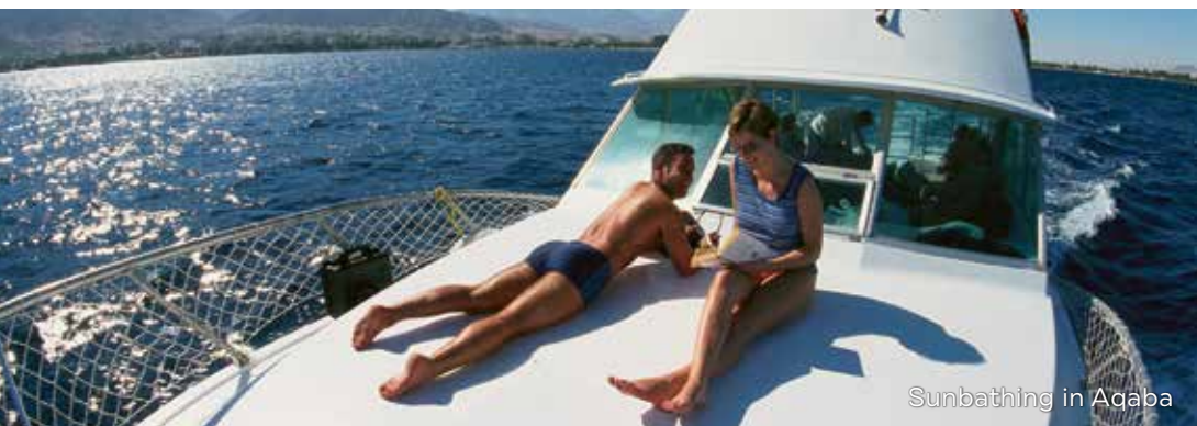
Sunbathing in Aqaba