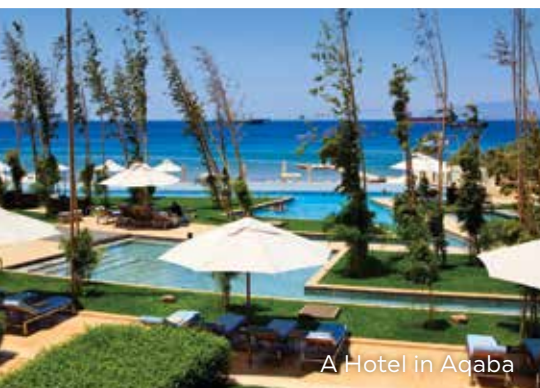
A Hotel in Aqaba