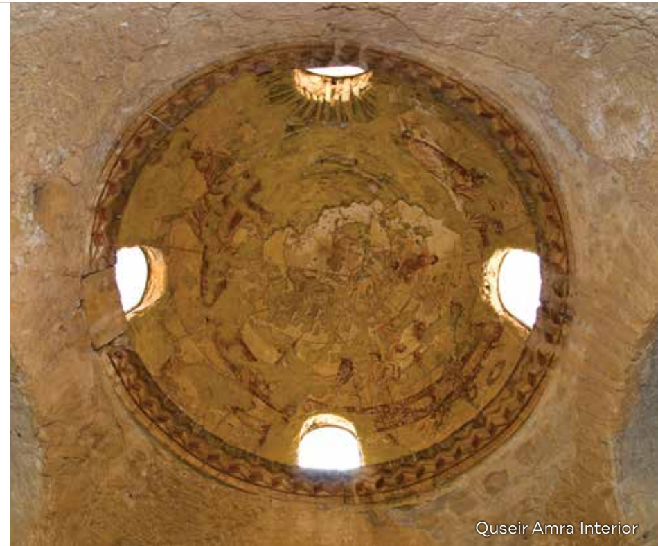
Quseir Amra Interior