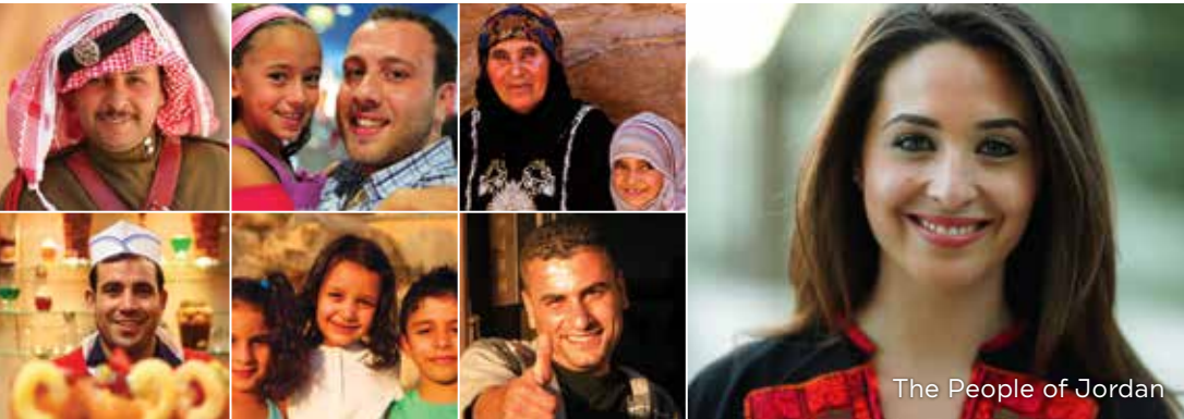
The People of Jordan