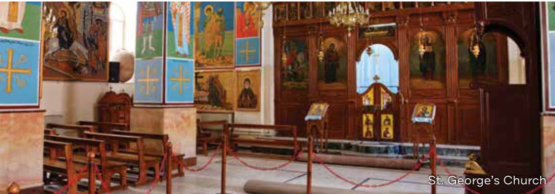
St. George's Church