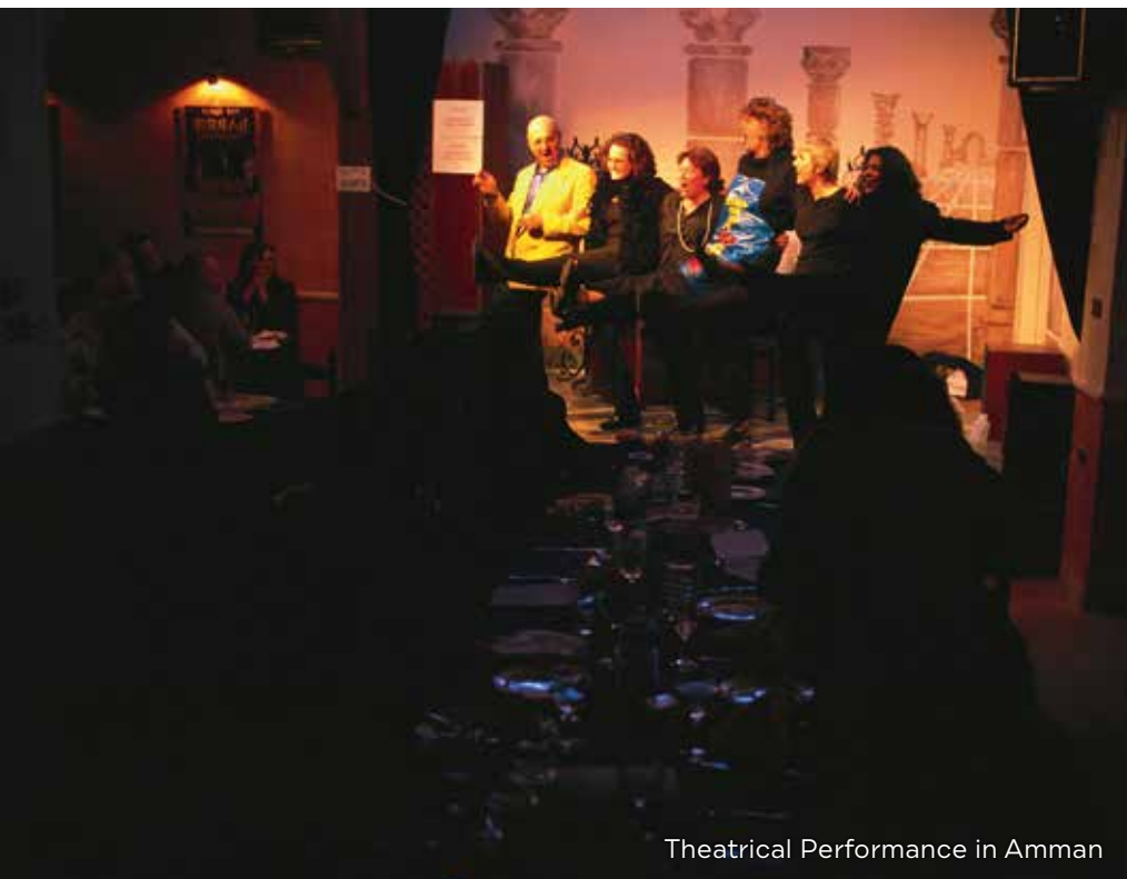
Theatrical Performance in Amman