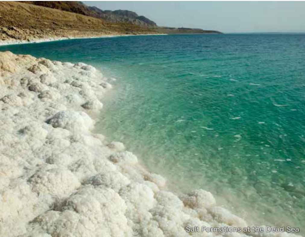
Salt Formations at the Dead Sea