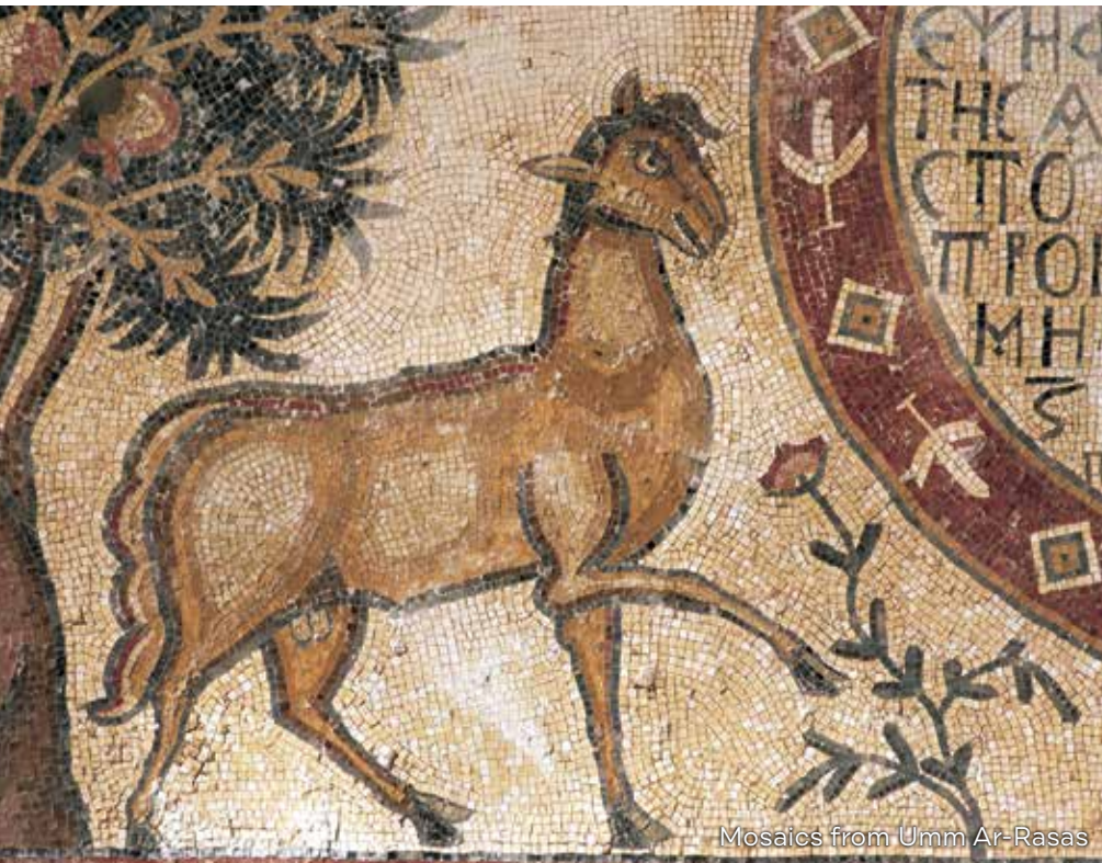
Mosaics from Umm Ar-Rasas