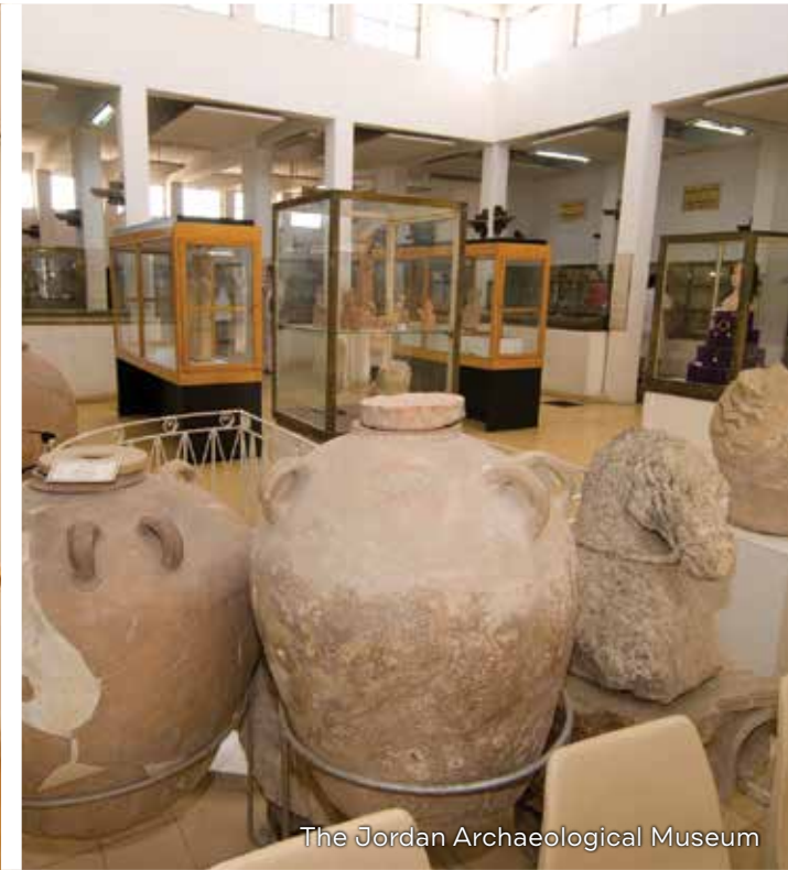
The Jordan Archaeological Museum