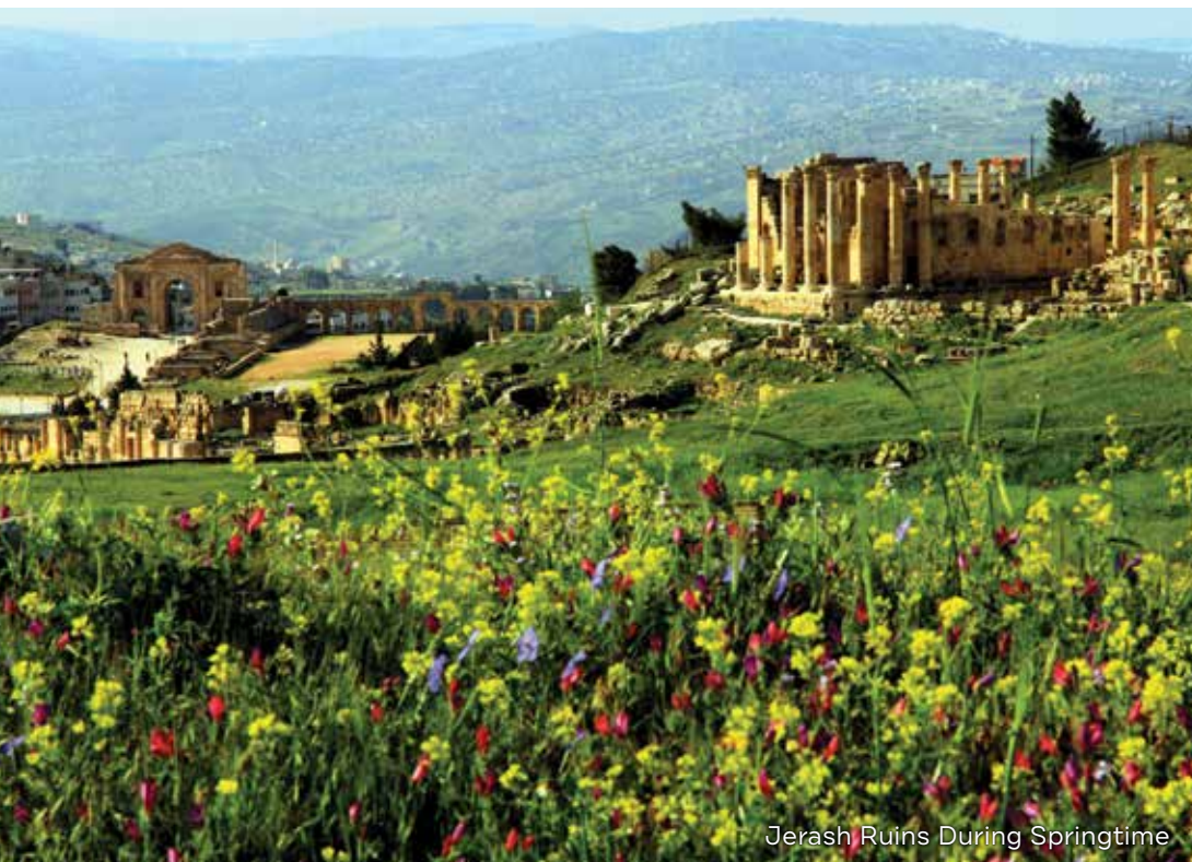
Jerash Ruins During Springtime