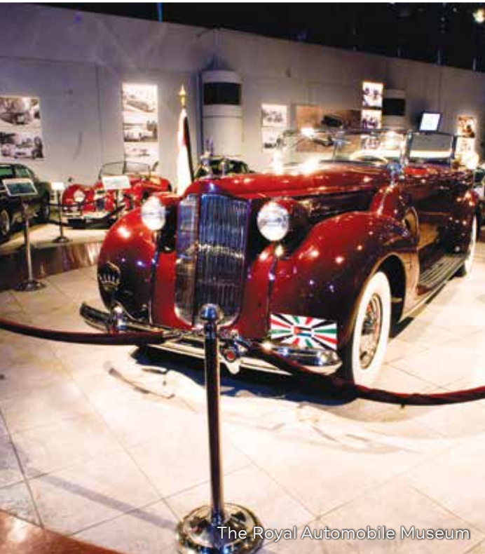
The Royal Automobile Museum