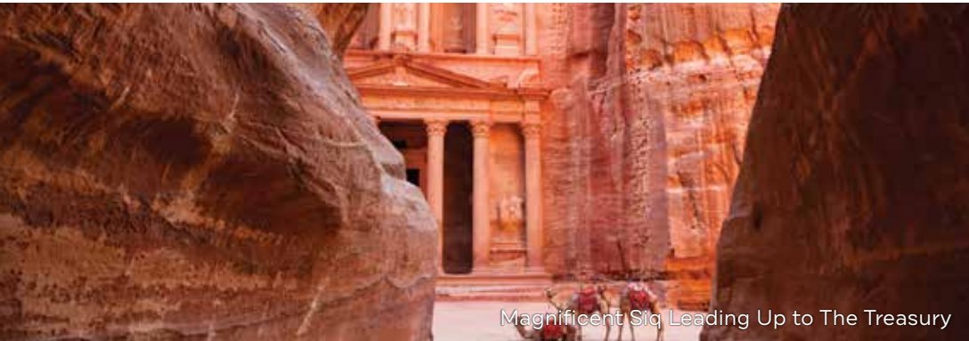
Magnificent Siq Leading Up to The Treasury