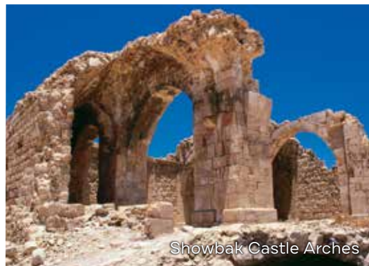
Showbak Castle Arches