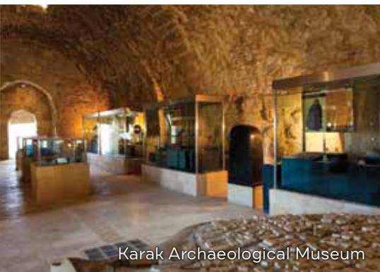
Karak Archaeological Museum