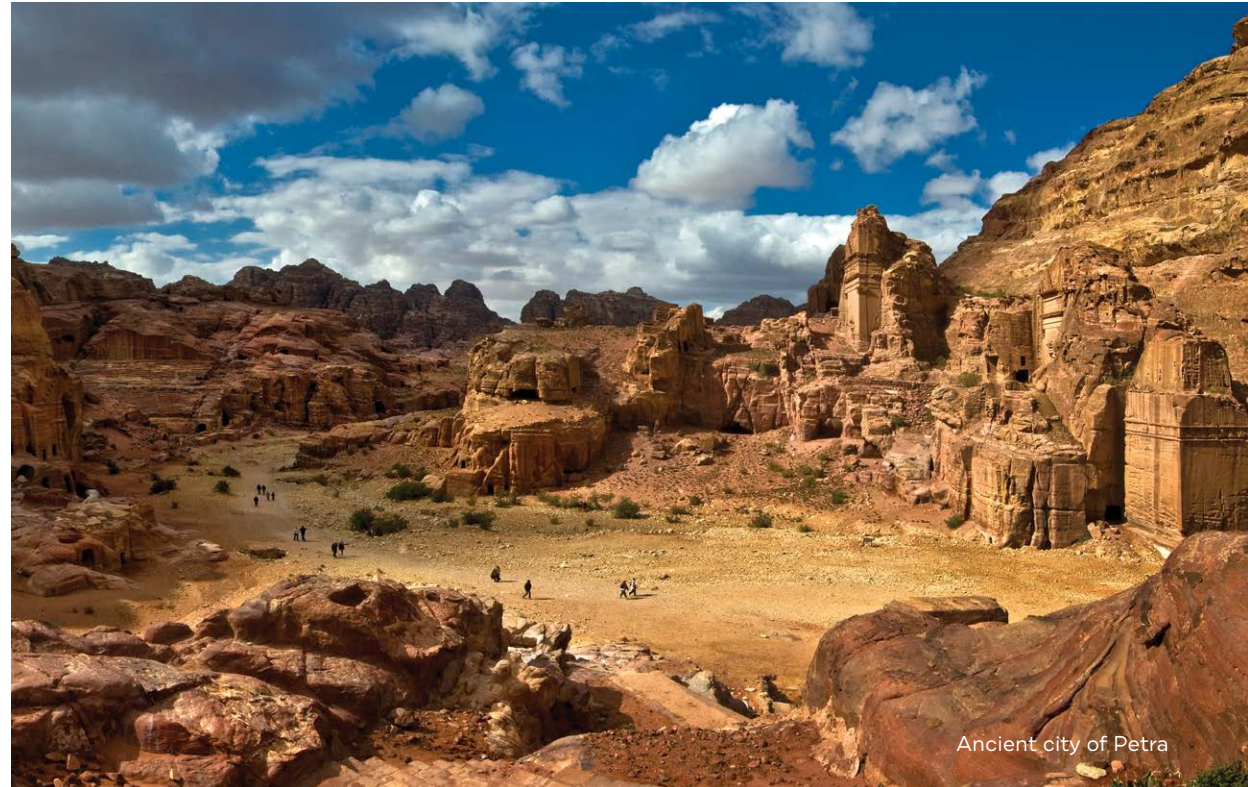
Ancient city of Petra