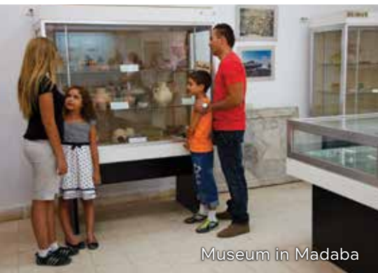
Museum in Madaba