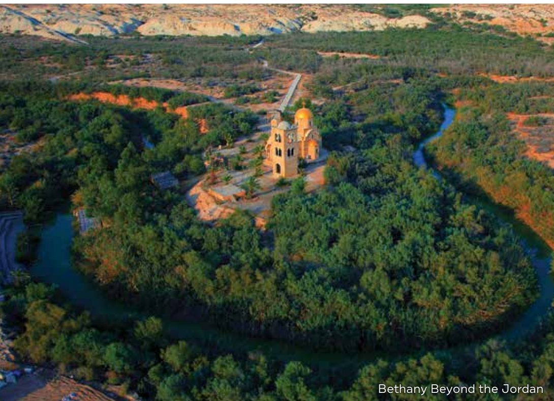
Bethany Beyond the Jordan