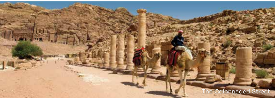
The Colonnaded Street

Trade caravans laden would break at Petra, which offered a plentiful supply of water and protection from marauders. In return for their hospitality, the Nabataeans imposed a tax on all goods that passed through the city and grew wealthy from the proceeds. Petra later flourished under Roman rule, and many Roman-style amendments were made to the city, including the enlargement of the theatre, paving of the colonnaded street, and a triumphal arch was built over the entrance to the Siq. When the Roman Emperor, Hadrian, visited the site in 131 AD, he named it after himself, Hadrian Petra.