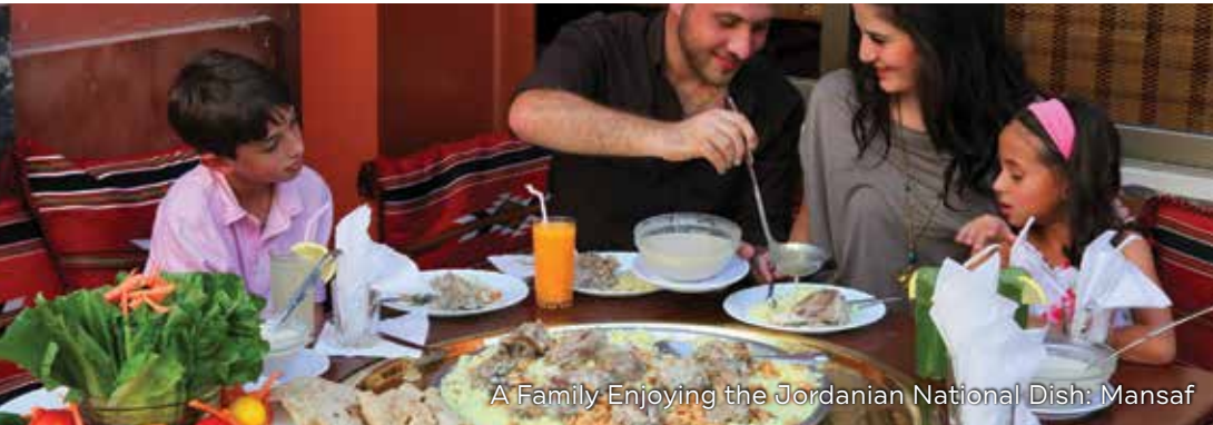
A Family Enjoying the Jordanian National Dish: Mansaf