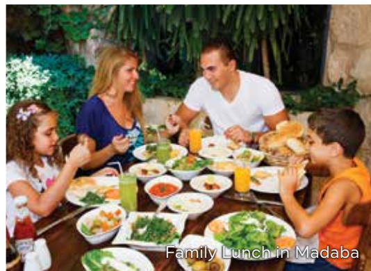
Family Lunch in Madaba