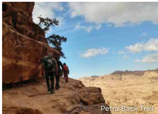
Petra Back Trail

Petra, Wadi Rum, and Aqaba are also known as the Jordan's golden triangle. Here you can hike the footsteps of ancient civilizations, dive in the warm waters of the Red Sea, or experience the Mars-like desert of Wadi Rum.