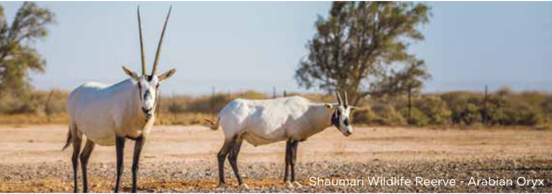
Shaumari Wildlife Reerve - Arabian Oryx