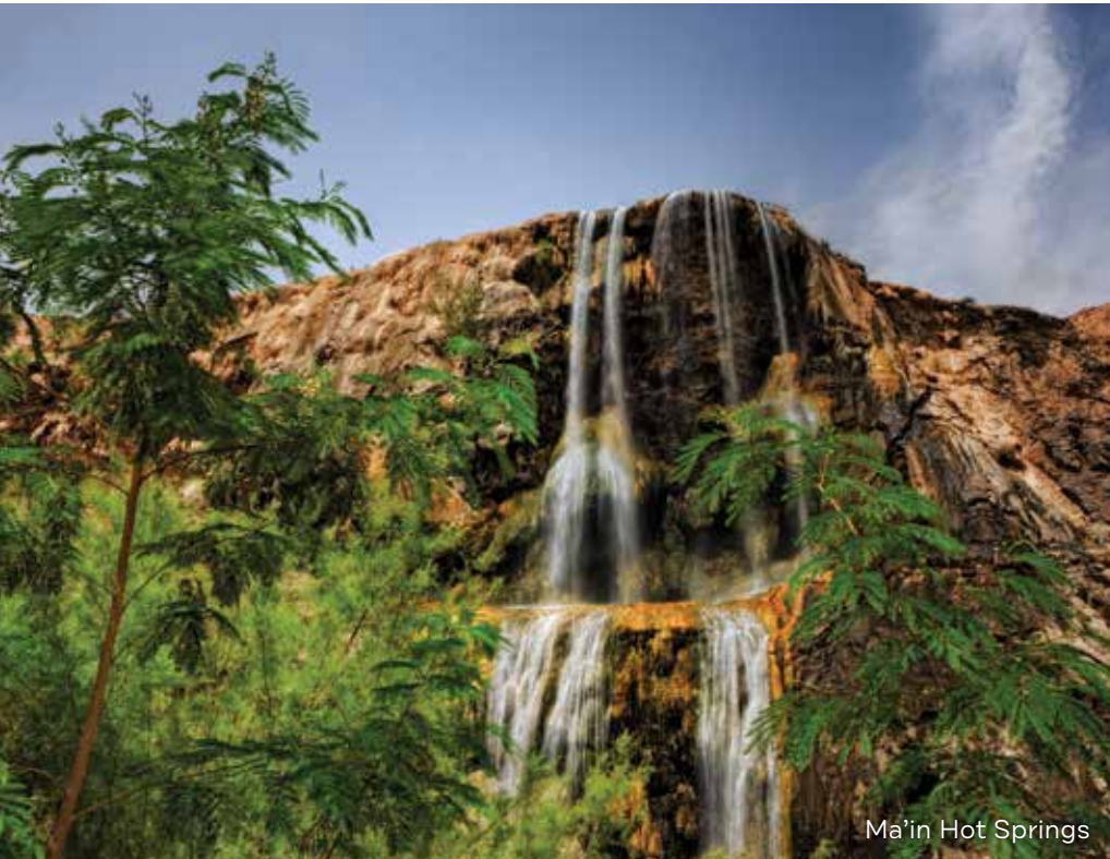
Ma'in Hot Springs

In the western highlands, including the wooded areas of the north in Zobia, Ajlun and Dibeen, and Dana in the south, the Mediterranean habitats surrounded by open steppe country are home to the Palestine Sunbird, the Upcher's Orphan and Sardinian Warblers. The more open steppe habitats typically host the Spectacled Warbler, Long-Billed Pipit, Black-Eared Wheatear, Woodchat Shrike and Linnet.