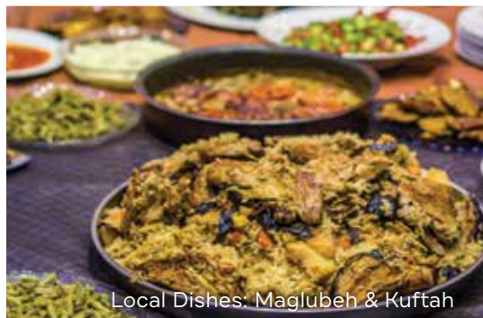
Local Dishes: Maglubeh & Kuftah