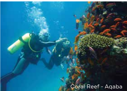
Coral Reef - Aqaba