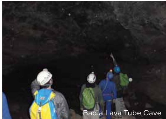
Badia Lava Tube Cave

In ancient times, a now inactive volcano in the southern borders of Syria erupted and painted our east with blankets of volcanic rocks. This area holds multiple lakes and even an oasis in its center that once was the size of Manhattan. This unique landscape and its oases are home to many exotic animals.