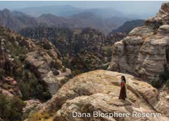
Dana Biosphere Reserve