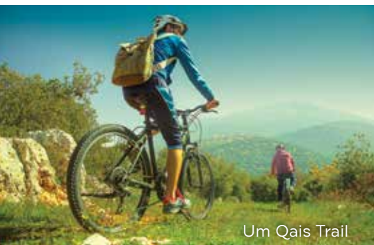
Um Qais Trail