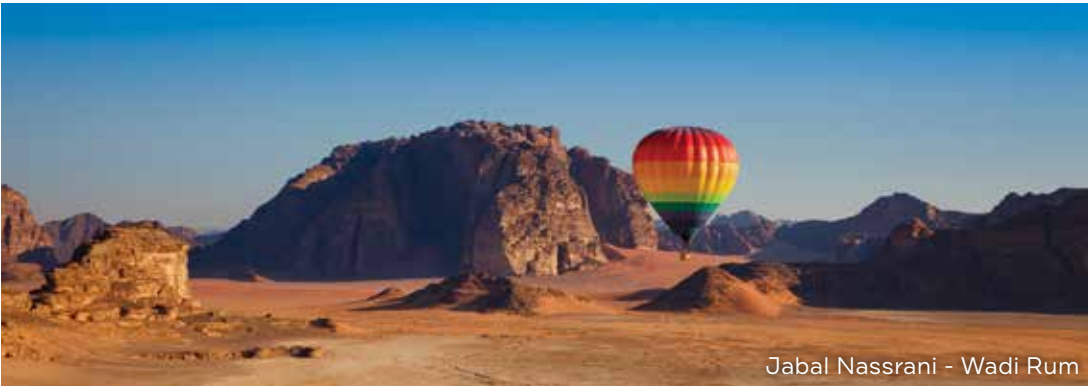
Jabal Nassrani - Wadi Rum