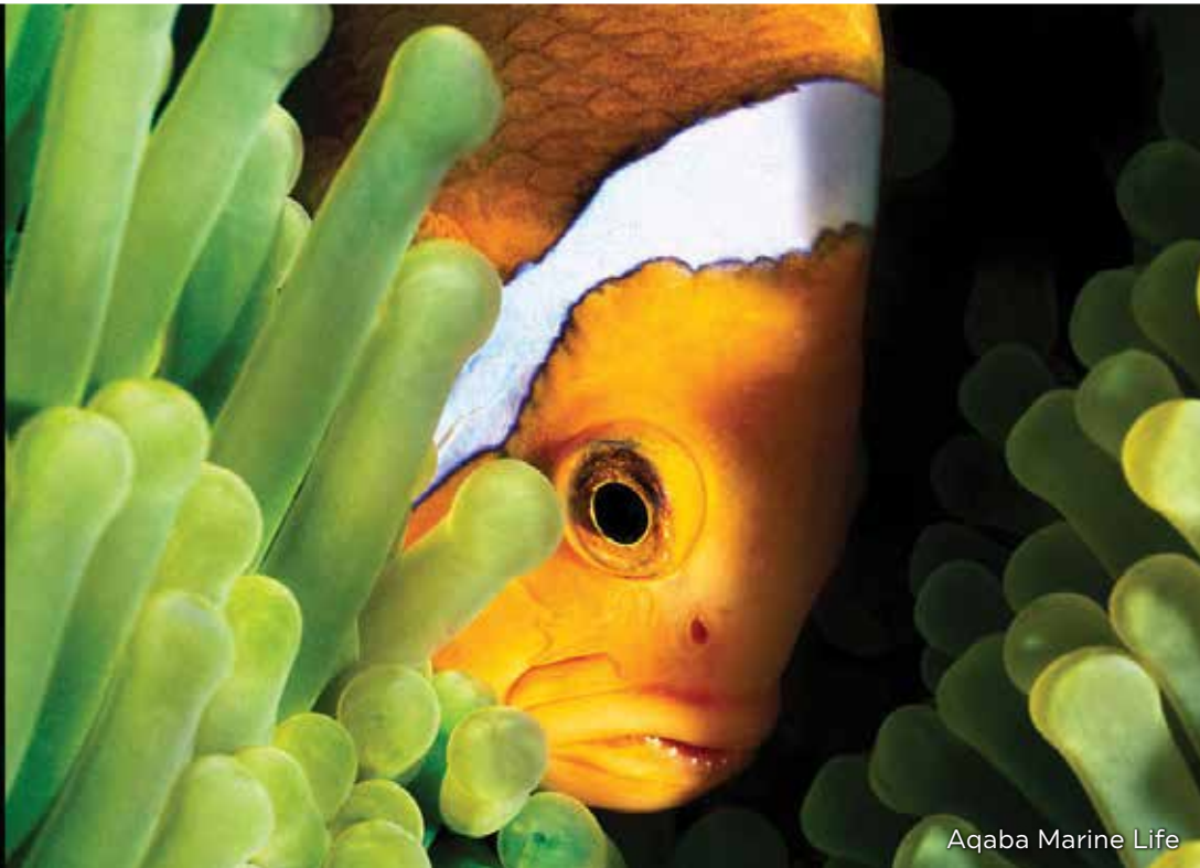
Aqaba Marine Life