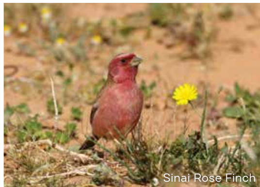
Sinai Rose Finch