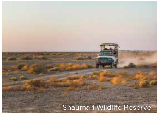
Shaumari Wildlife Reserve