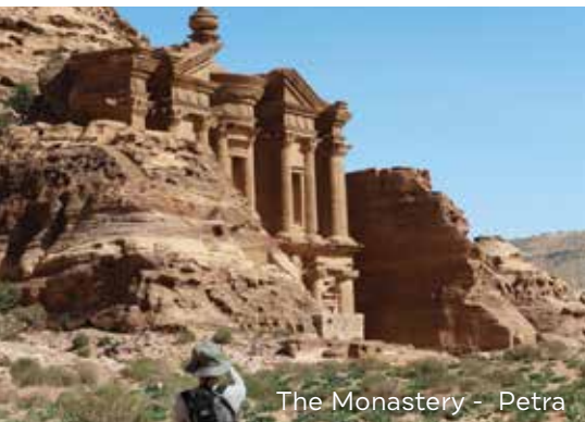
The Monastery - Petra