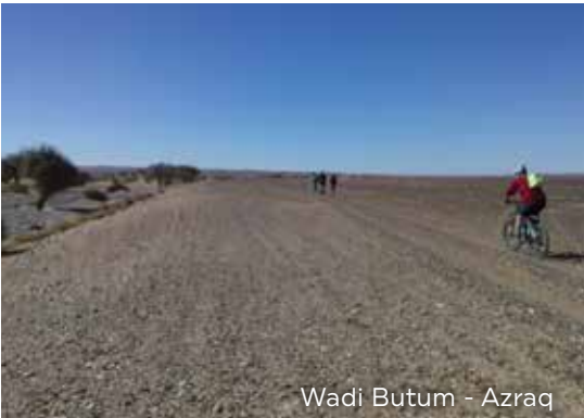
Wadi Butum - Azraq