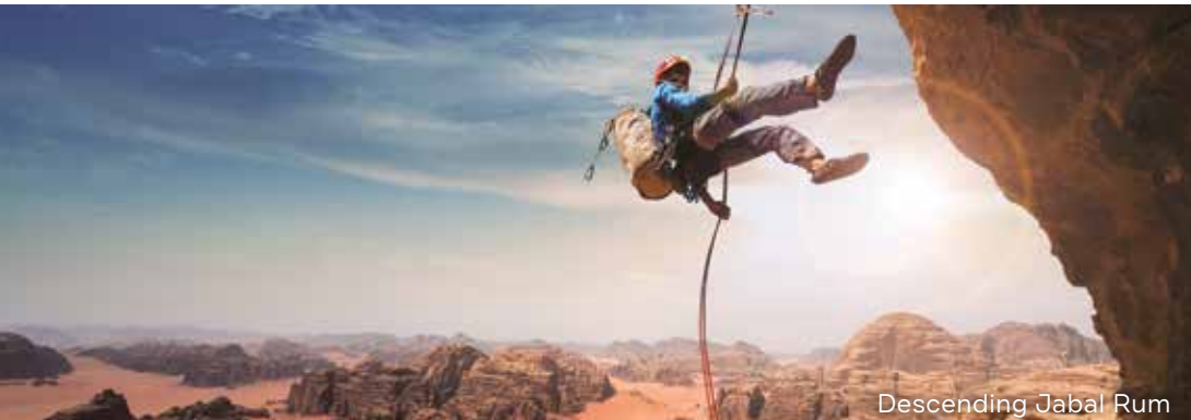
Descending Jabal Rum