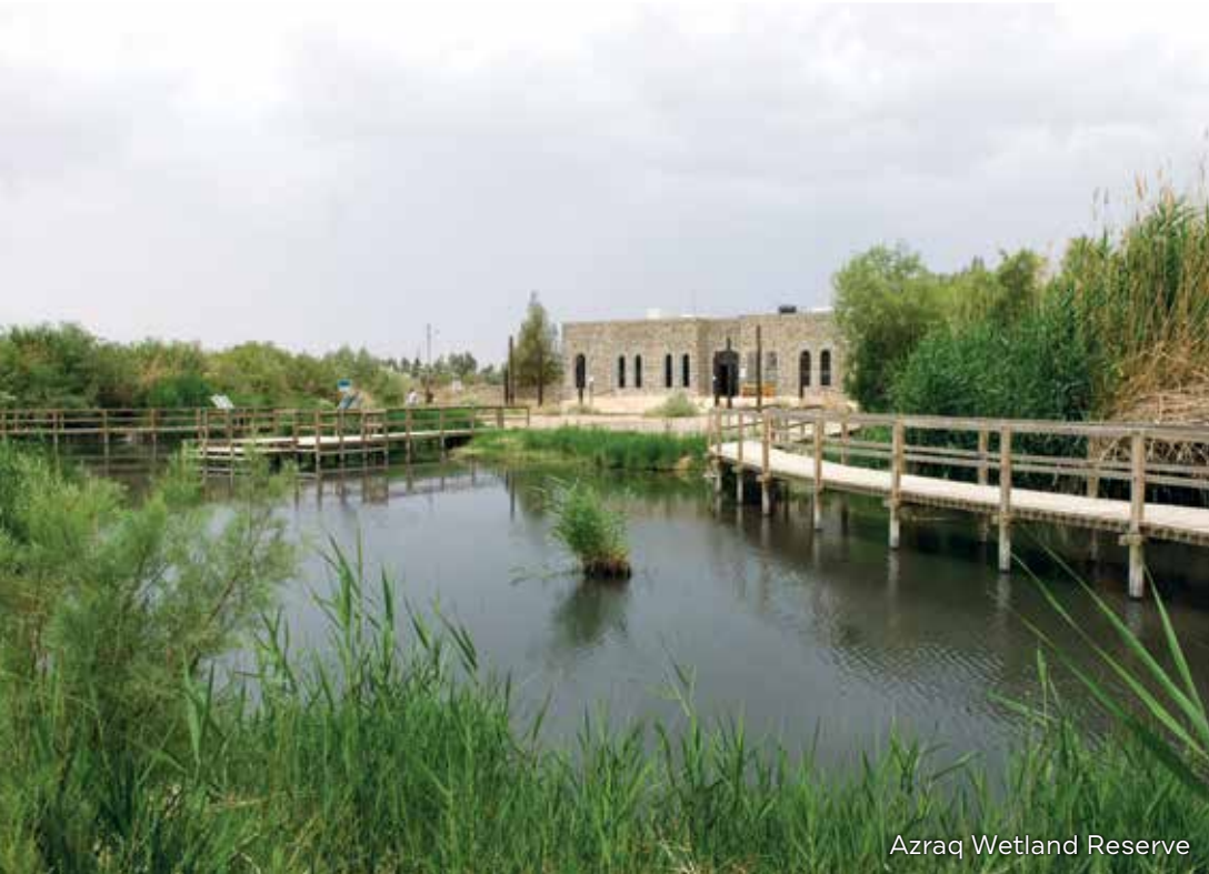
Azraq Wetland Reserve